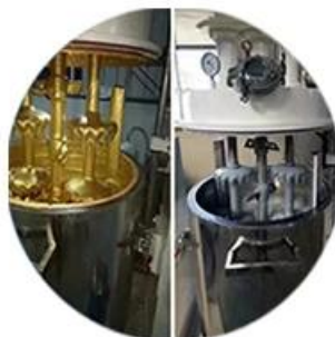
Batching Production Line