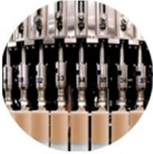
Filling Machine Line