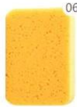
06 The sponge