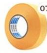
07 Masking Tape