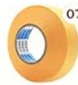
07 Masking Tape