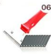
06 Perching Knife