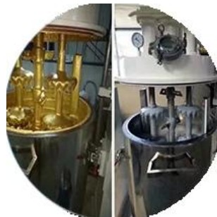
Batching □□ □□