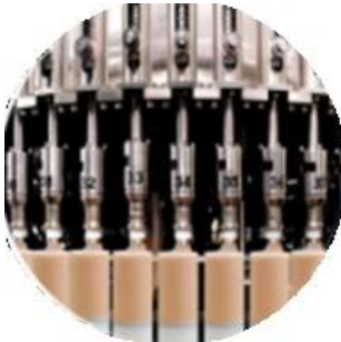
Filling □□ □□