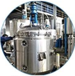
Creaming Machine Line