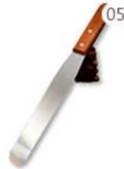
05 Stirring Knife