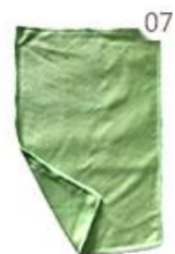
07 Scouring Pad