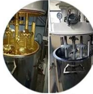
Batching Production Line