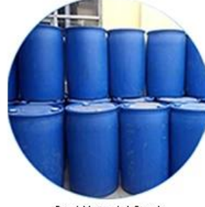
Real Material Stock