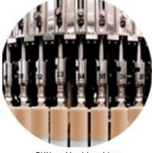
Filling Machine Line