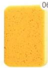
06 The sponge