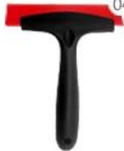
04 Rainbow Scraper