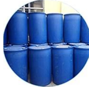
Real Material Stock