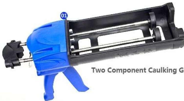
Two Component Caulking Gun