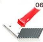
06 Perching Knife