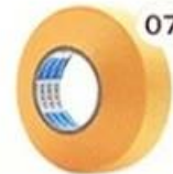
07 Masking Tape