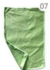
07 Scouring Pad