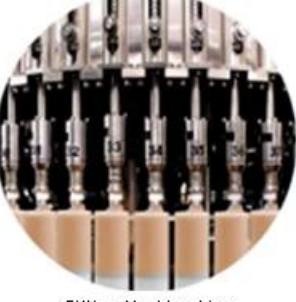
Filling Machine Line