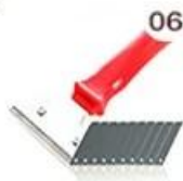
06 Perching Knife